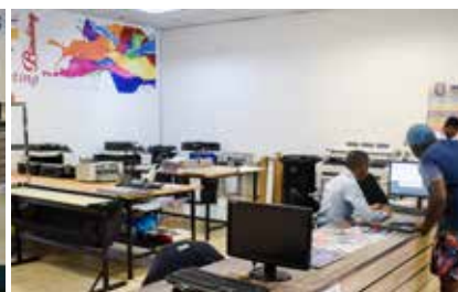
TURNRITE MALL BRANCH