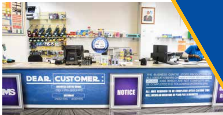
GAME CITY BRANCH