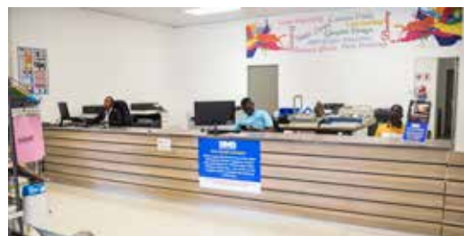
SARONA CITY MALL BRANCH