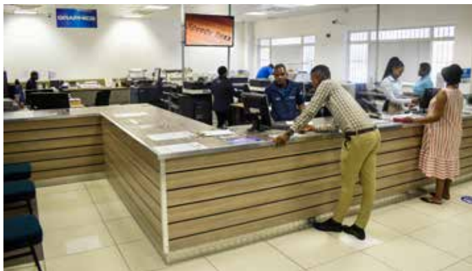
CENTRAL BUSINESS DISTRICT BRANCH